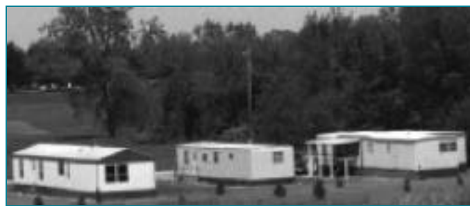
COMMON QUARTERS -- Trailers are the most common type of farmworker housing in Berrien County. These units are allocated to the same families, most whom have returned to this farm for a decade, each year.

Though both growers and farmworkers emphasize the importance of the availability of good housing, it is not a sufficient condition to have adequate farm labor. Growers in Oceana County reported that though the demand for hand-harvested fruits and vegetables, such as asparagus, cherries, and apples, has increased it is difficult to find local people willing to work on farms. While growers' need for labor has increased, the labor market has tightened and unemployment rates dropped. Conse-