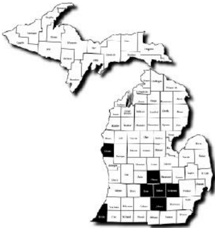
STUDY AREAS -- The Michigan Counties included in the recent JSRI research study included Oceana, Berrien, Eaton, Ingham, Livingston, Jackson, and Clinton.

Growers with better housing are more likely to employ the same families year to year. They feel there are many benefits to having a consistent and familiar work force. They think they have an enhanced relationship with the workers, the families take better care of the